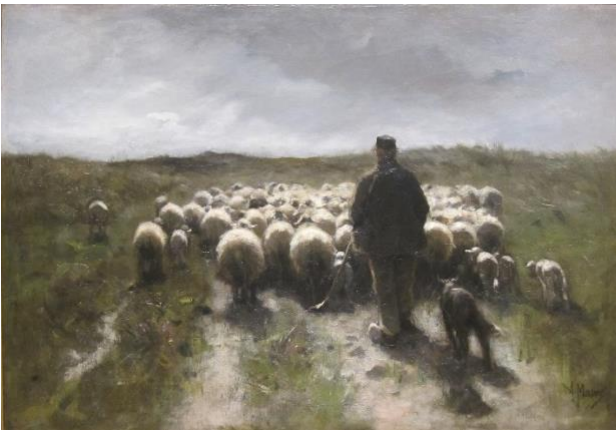
Shepherd and Sheep – Anton Mauve (1838-1888)

Truth Lord, but I have marred them: let my shame Go where it doth deserve. And know you not, says Love, who bore the blame? My dear, then I will serve. You must sit down, says Love, and taste my meat: So I did sit and eat.